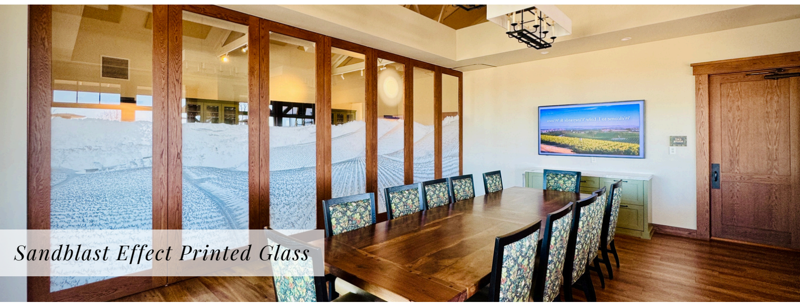
Sandblast Effect Printed Glass